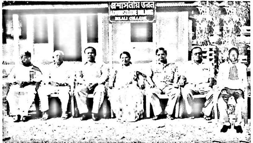
Governing Body, Bikali College

ADDRESS : Bikali College, P.O. Dhupdhara District-Goalpara, Assam, India Pin Code : 783 123 Phone Code : 03663 No. 284331