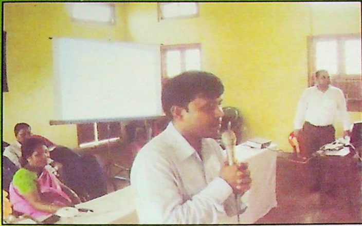
A view of Seminar on T.T organized by the college in collaboration with Third Eye, Guwahati