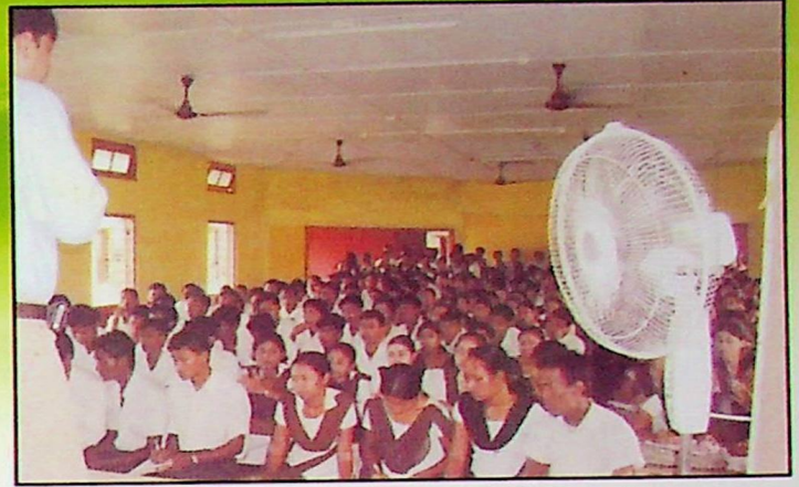
Students' participating in I.T. Seminar