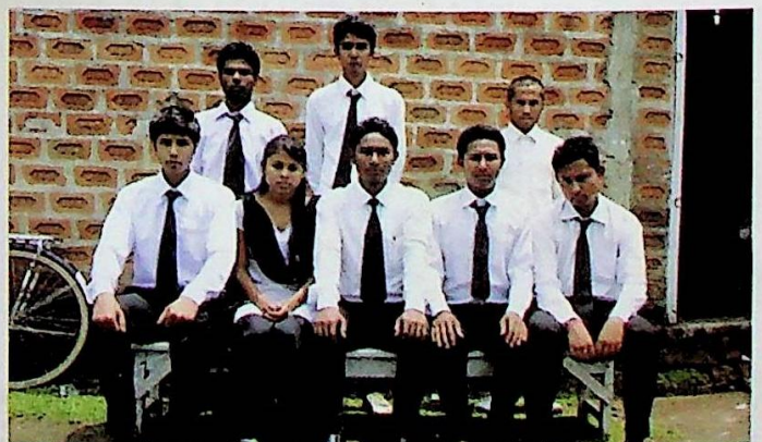
Bikali College Students' Union