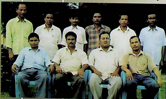
Non Teaching Staff